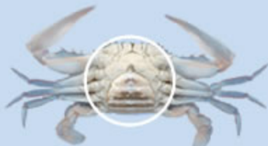
Mature Female - Sook

The she-crab or immature female crab has an inverted V-shaped apron. Females have orange tipped claws.