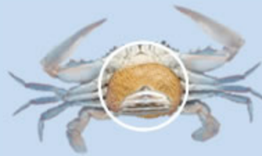
Female with eggs - Sponge Crab

A mature female has a widened apron with a semicircular bell shape that looks like the U.S. Capitol building. She is called a sook .