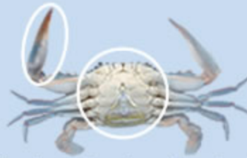
Immature Female - She-Crab

The male crab, or jimmy, has blue claws and an underside "apron" which looks like an upside-down T or the "Washington Monument." Large male crabs are also called channelers .